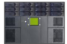
Active Media Library 4X