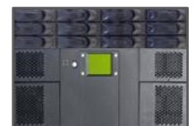
Active Media Library 4X